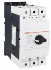
Motor protection circuit breaker SM3R